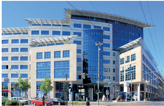
"Studienkolleg" in central Leipzig (close to the main station)

A great academic education for a low cost. The tuition fee at German universities lies between 100 - 300 Euros per semester.